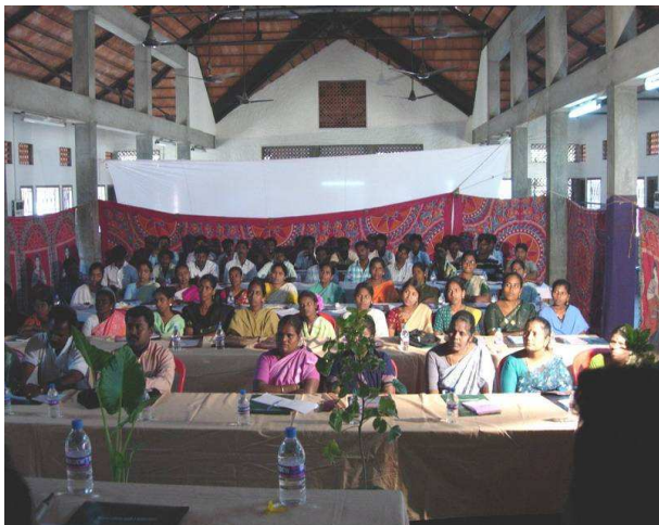
Almost 1000 primary school teachers, health nurses, health inspectors, college students, youth activists, field workers from other NGO's and members of women's development movements have been trained into provide psychosocial support to the tsunami-affected communities South-east India.

plans of action. Scientific jargon was avoided and the concepts were delivered in a simple manner, understandable by a lay person with basic high school education.