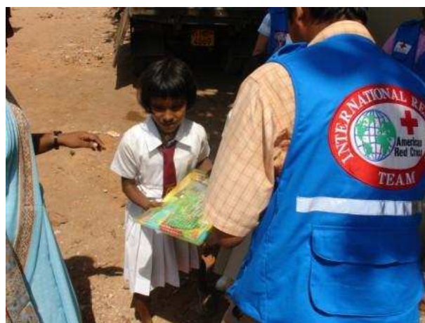
A big challenge was to develop culturally appropriate systems, methods and material that reflect the various regions of India, which is a country with a great cultural and linguistic diversity. Because of this great diversity, involving local volunteers has a great advantage.

The Resilient school programme is aimed at enhancing the skills of teachers, students and volunteers to prepare for and respond to disasters, crises and emergencies through training, crisis response planning and creative and expressive activities. The crisis response planning is a process that facilitates the participation of the school community in taking proactive measures to take action in the event of a disaster. It involves formation of four teams namely, evacuation, damage assessment, psychological first aid and physical first aid.